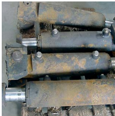
Before repair work ...