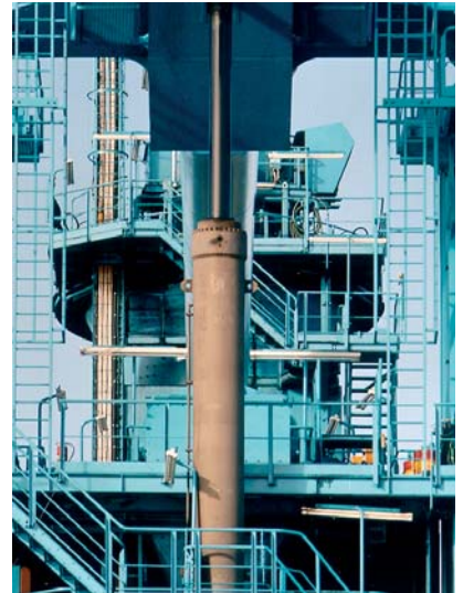
Cylinders with stroke: 6 m, weight: 14 t