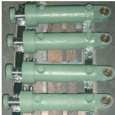
... and after repair work.