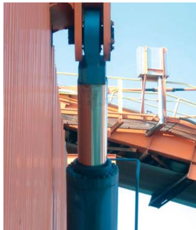
Cylinders from HYDROSAAR withstand aggressive salty seawater, sea air, dirt and dust.