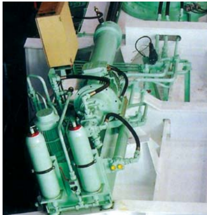
Hydraulic unit with stabilization cylinders.