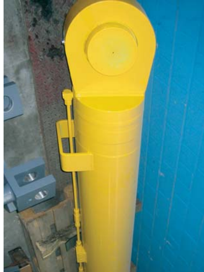
Cylinder with stroke: 4 m, weight: 8 t