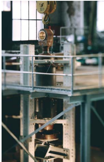
Disassembly stand HYDROSAAR